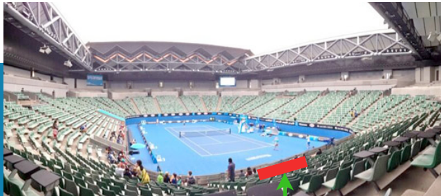
Margaret Court Arena Corporate shaded seats Front & second rows

The brand new Margaret Court Arena with its retractable roof will replace Hisense Arena in 2015.